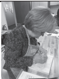
A participant at our Professional Development Day 2017—printmaking