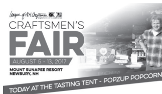
The Tasting Tent welcomed a new vendor—Popzup Popcorn