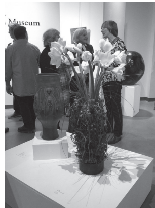
Flowers and guests were in abundance at the Art and Bloom event during our Black and White Encore Exhibition