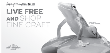
Fine craft galleries' promotions

A few images from our past year - thank you to Sullivan Creative and League staff for images/photos