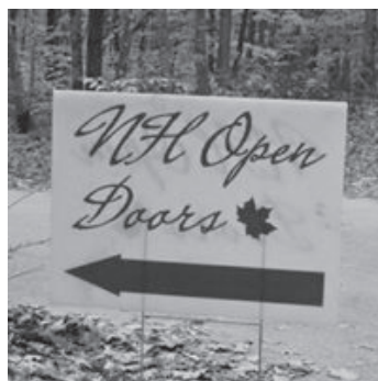
The League coordinates the popular NH Open Doors program in the Fall and Spring