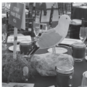
The League provided tablescapes for inaugural events in January