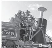
Peppersass at the Fair