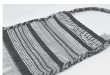
Louise Wood bag